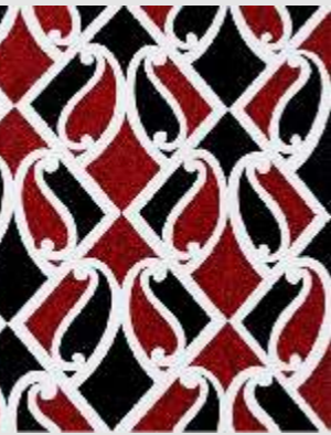
Black and White T.V. Reuben Paterson Image reproduced courtesy of the artist 2005

Also important in Māori culture is the belief that your tūpuna are always with you, guiding you and protecting you and that their wairua can become embodied in whenua (land), in te reo (language) and in taonga (treasures). Ultimately death is a loss which leaves a trace of something very powerful behind, as the