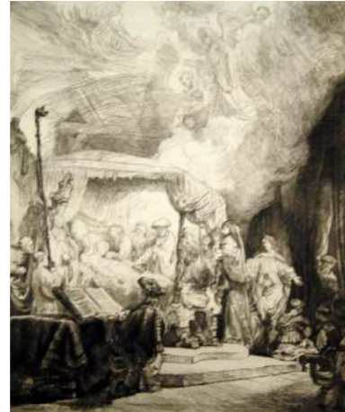
Death of the Virgin Rembrandt van Rijn (b.1606, d.1669) 1659

Christianity has since spread and diversified and now encompasses about a third of the world's belief system. Broadly speaking, Christianity's view of mortality embraces the conviction that everyone can share in Christ's sacrifice of himself for their sins, and so have eternal life. There is a strong belief in a good ending, that despite any harm or grief